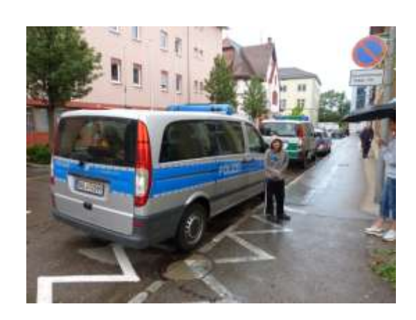
Police van in Waldshut, Germany.