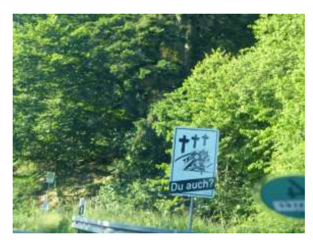
Sign with picture of a MC rider tipping over in a curve with three crosses on top, signifying