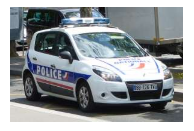
National Police Vehicle in Paris, France