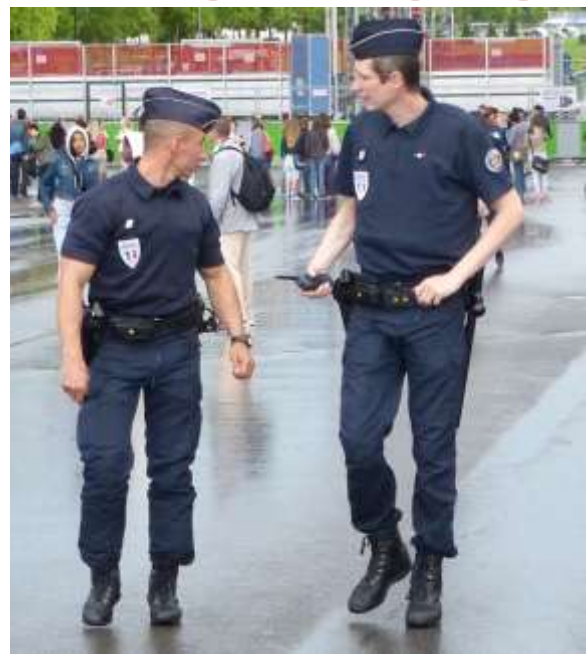
French National Police at the Eiffel tower